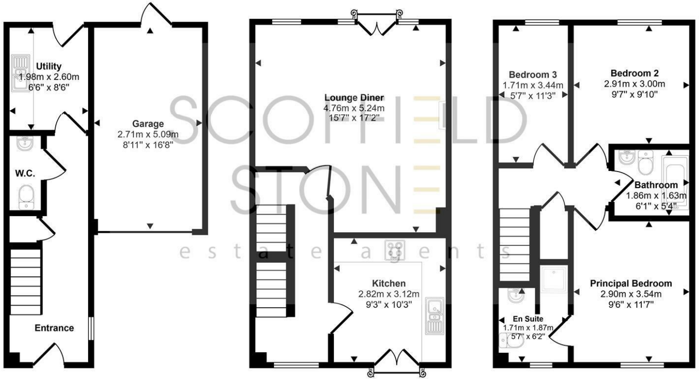
Ground Floor Approx 31 sq m / 337 sq ft

Approx Gross Internal Area 112 sq m / 1209 sq ft